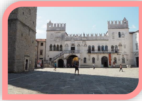
Praetorian Palace in the centre of old Koper

The second partner meeting was hosted on 3 rd - 4 th June 2019 by the Slovenian partner – University of Primorska. The partners from the Pedagogical Faculty welcomed all the project partners to the beautiful historic city of Koper by the Adriatic sea.